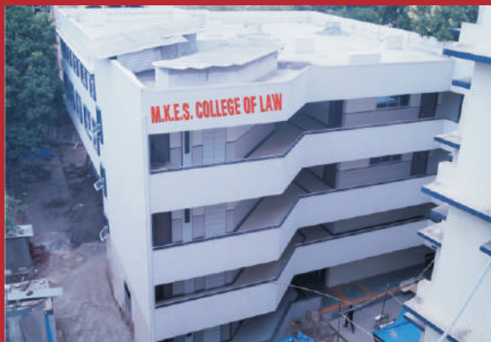
MOOT COURT HALL