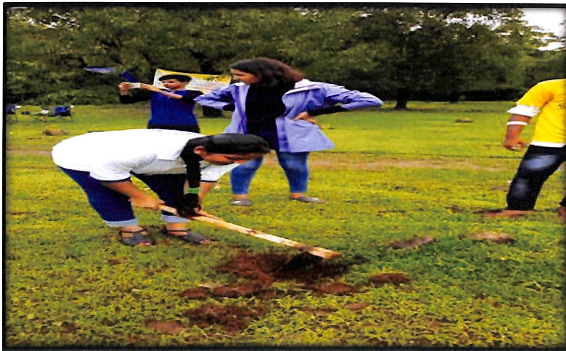
“Tree Plantation at Sanjay Gandhi National Park”

Date : 2nd July, 2017 Venue : Sanjay Gandhi National Park No. of Students : 12 Students (7 Male and 5 Female) Organizing Unit/ Collaborating Agency : NSS COMMITTEE Activity 4 : Students planted 128 saplings at Sanjay Gandhi National Park. It included Karanj, Mahua, Jambul, and Bamboo.