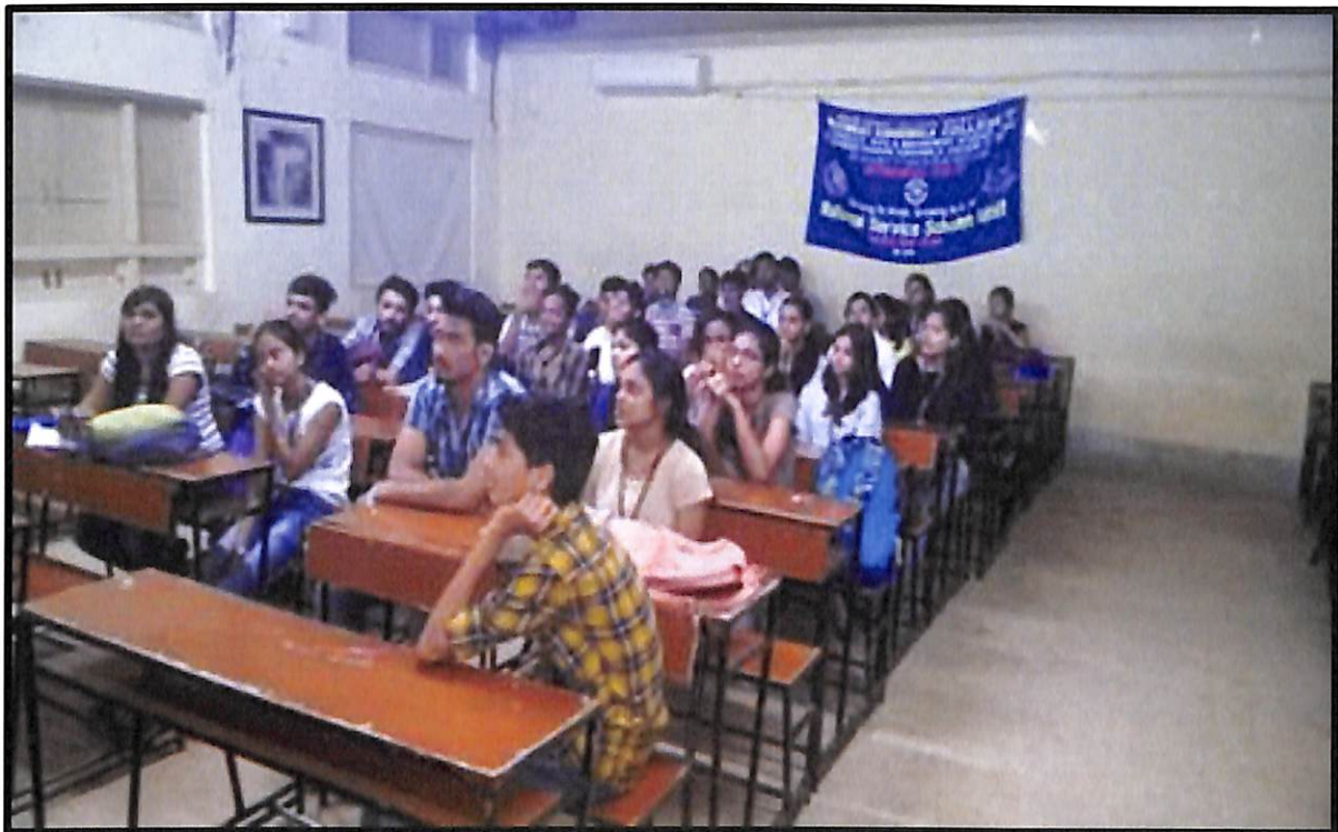
"Talk on water related diseases and prevention"