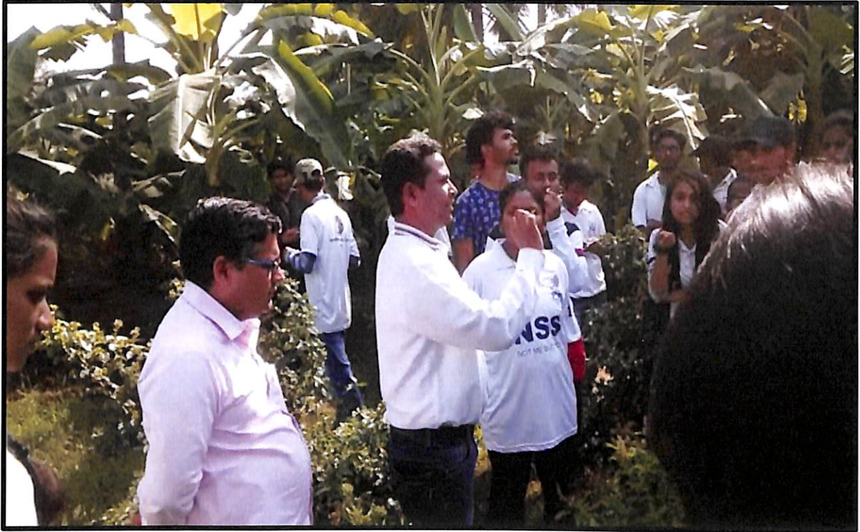
"Tree plantation at Arnala, Virar"