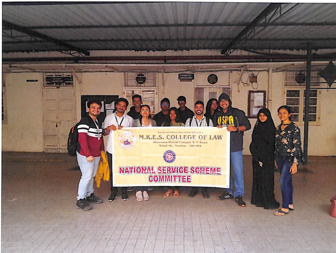
“Campus Cleaning Drive”