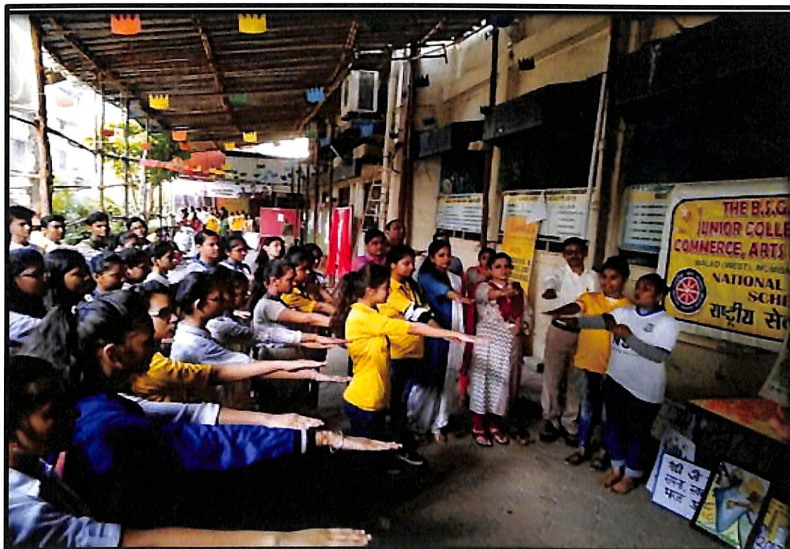
“Swachchh Bharat Oath”