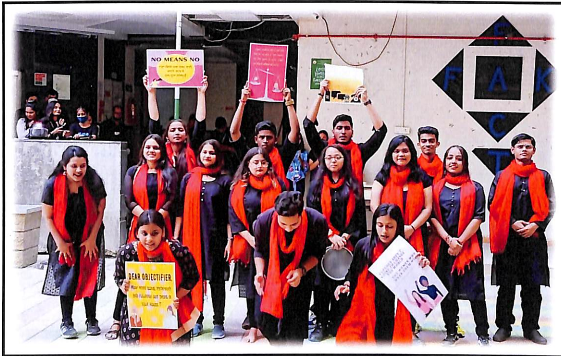
“Street Play On Women Empowerment”