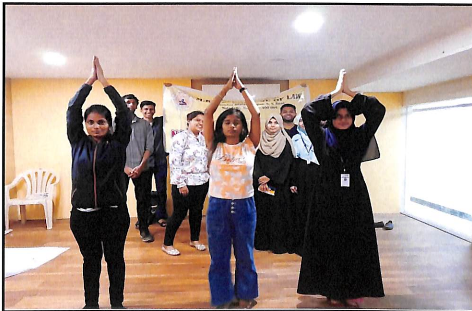
“INTERNATIONAL YOGA DAY”

Date : 21st June 2017 Venue : R.D. National College No. of Students : 12 Students ( 7 Male and 5 Female) Organizing Unit/ Collaborating Agency : NSS COMMITTEE in collaboration with Mumbai University Activity 3 : Students attended the 3 day University Yoga training camp held at R.D. National College to celebrate the International Yoga Day.